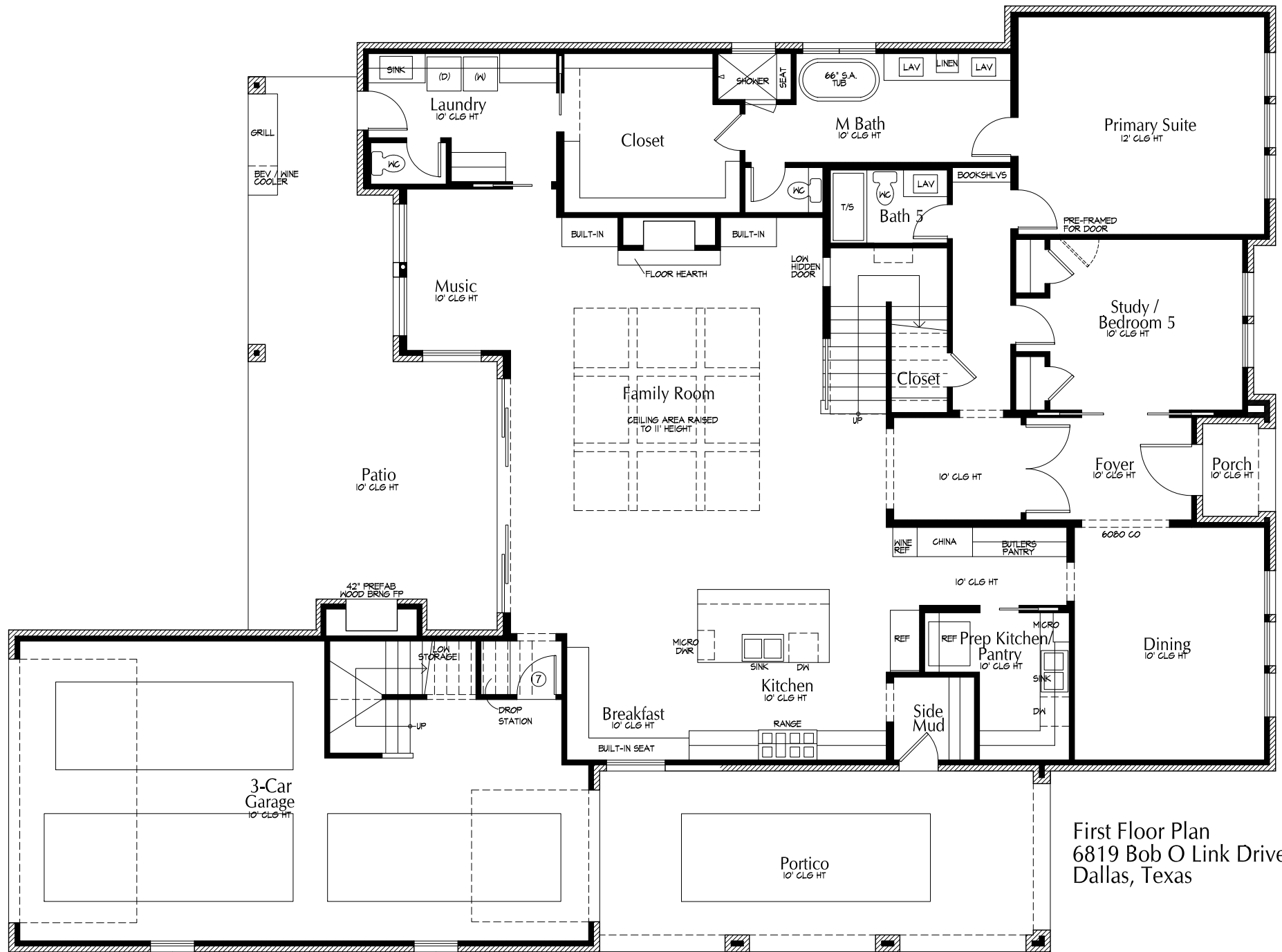
First Floor Plan 6819 Bob O Link Drive Dallas, Texas